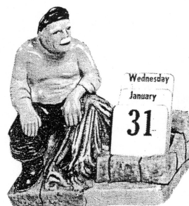
FISHERMAN Other figures include—Robin Hood, Smuggler, Figurines, Pixies, Beafeater, Sir Walter Raleigh, etc., etc. LISTS ON APPLICATION

We stock 200 lines in composition ware for general sale. Including— Thermometers, Calendars, Egg Timers, T.V. Lamps, Book Ends, Spill Holders, etc. —example