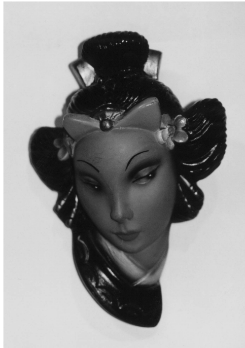
THE LEGEND ORIENTAL LADY circa 1947 APPROX